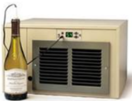
optional bottle probe